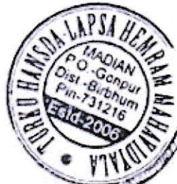
Head of the English Department

Co-Ordinator Turku Hansda Lapsa Hemram Mahavidyalay Mallarpur, Birbhum, 731216 (W.B.)